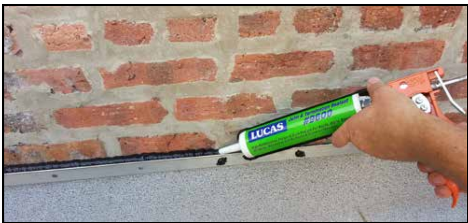
JOINT AND TERMINATION

Lucas #9600 non-shrinking formula has outstanding adhesion properties to metal, concrete, masonry, wood, EPDM, PVC, vinyl surfaces, silicone surfaces and most other common building materials. Available in 7 colors.